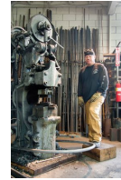
Local Blacksmith Forges Ahead with Age-Old Trade